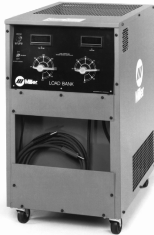
Welding Power Load Bank

The welding power load bank is designed to load test the output of transformer-type, engine- or motor-driven generator welding power sources. This portable unit can be used to test AC or DC welder outputs, and to demonstrate welding equipment to prospective customers.