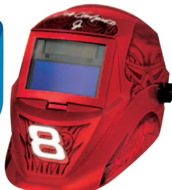
Dale Earnhardt Jr.*