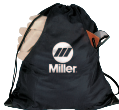
Helmet Bag with Miller Logo

Features drawstring closure, ultra-soft inside liner and convenient exterior storage pouch for gloves, glasses, etc. #770 250 $9.95