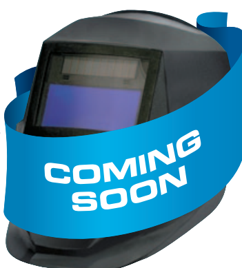
Dale Earnhardt Sr.*