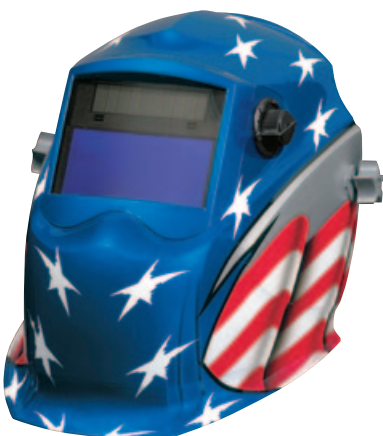
Stars and Stripes

Includes optional Hobart helmet bag. #770 251